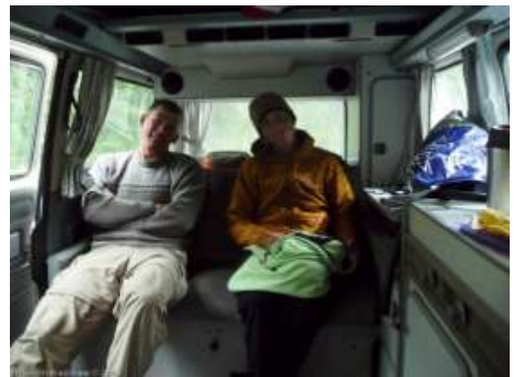
Chilling in the Van pondering the rain

Several diversions on the way to dinner. Found a nice camp spot, and a not so nice spot. Passing Bridge Creek CG we saw a sign for EV LOR4 at 8m GCamp. Hmm... free camping? Pulling in to the group camp many familiar faces. And a friendly invite to join. We managed to pull free (easier than the commando chipmunks earlier) and grabbed burgers and beer in town. What a great day. Good trip, great views, sunshine, campfire with so many buddies... AH... mountain life... life is good :-)