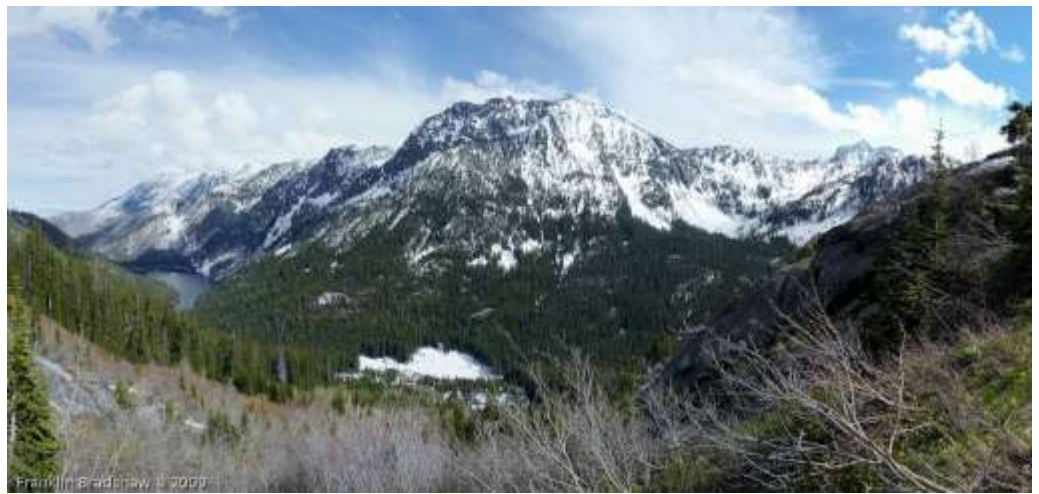
From In Bradshaw © 2009

We started out going down to go right (4:10p, c6150'). Traversing left would need agent orange... Looked to bugger up so we followed a weakness in the slide alder down small dry creeks. Weaving in and out, walking on and under still making surprisingly good time. At one point seeing fairly fresh down boot tracks (less than a week). 35 minutes we were through ready to traverse the creek (c4970, 6.8m, 4:45p).