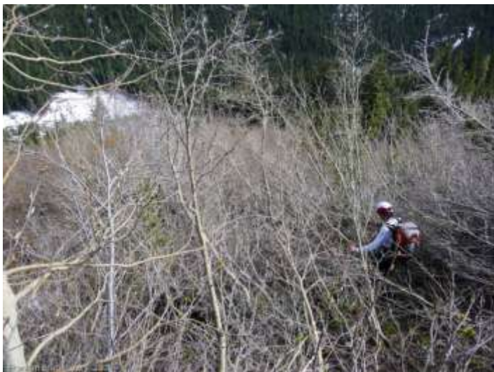
Carla leading down the Slide Alder