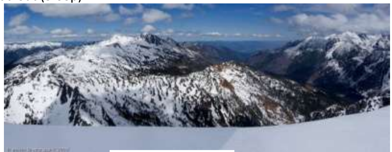
Cashmere south basin