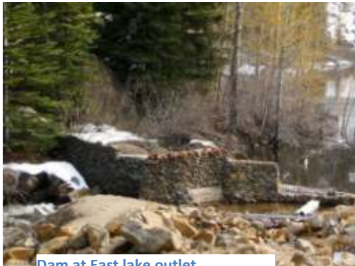
Dam at East lake outlet

West end of lake (5:08, 7.2m, c4715') removed gators and worked back along an improving trail. The fisherman had happy success today, the extreme sledders and their sleds not back yet. Checked out the old dam on the east outflow (5:40, 8.1m), a few last pictures of the lake and headed out. Past a quiet Little Eightmile lake with its giant tree (5:55, 8.6m, c4440), through the burns trying our hand at name that burnt tree. An enjoyable attribute of this trail is its change from raging creek, green areas, burns and magnificent large trees (and variety). Not too many places I remember seeing cedar this far east of the crest.