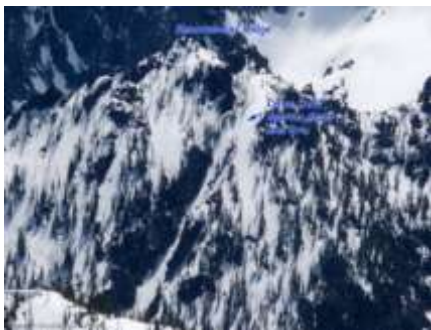
Scramblers on Mountaineers Ridge

7996', 4661 ascent, ~3200' from creek). Middle of the landing field was a summit cairn. Like a boy at recess I began digging it out with my hands and ax. Went down a few feet, cleared and rebuilt... no reg.