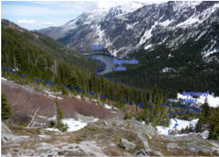
Route around Eightmile Lake and up

We started out going down to go right (4:10p, c6150'). Traversing left would need agent orange... Looked to bugger up so we followed a weakness in the slide alder down small dry creeks. Weaving in and out, walking on and under still making surprisingly good time. At one point seeing fairly fresh down boot tracks (less than a week). 35 minutes we were through ready to traverse the creek (c4970, 6.8m, 4:45p).