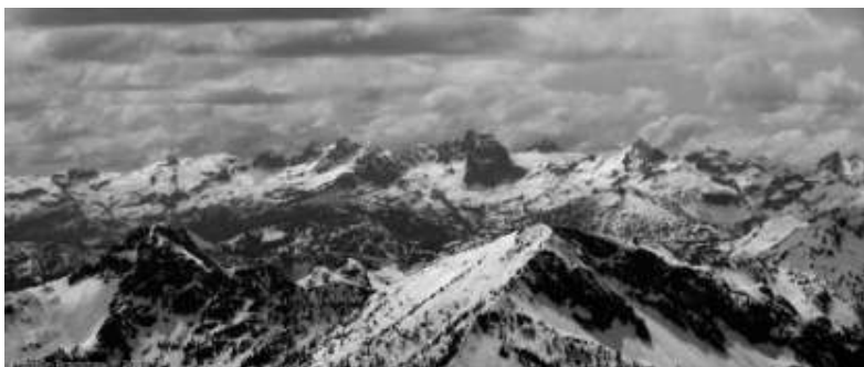
Chikamin Range -Chimney Rock center