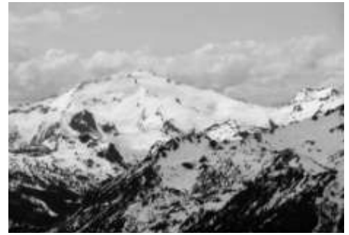
Mt Daniels left rock is Cathedral Rock